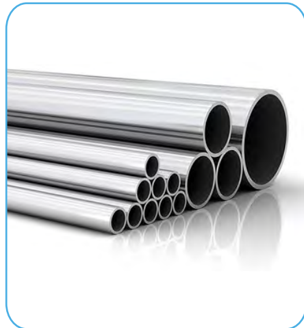
TUBE ASME BPE